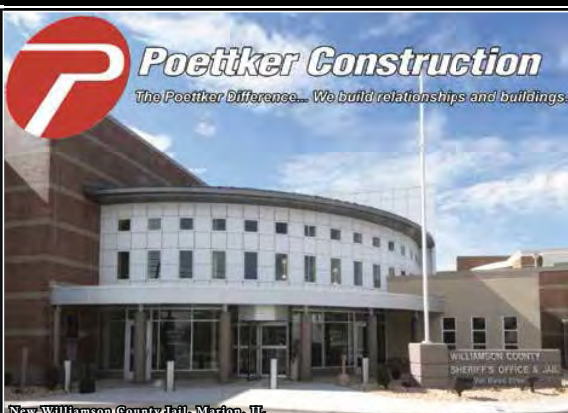
New Williamson County Jail, Marion, IL

CONSTRUCTION MANAGEMENT • GENERAL CONTRACTING • DESIGN/BUILD