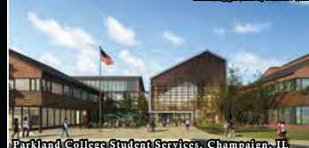
Parkland College Student Services, Champaign, IL