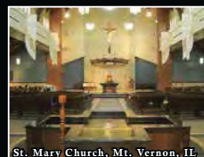
St. Mary Church, Mt. Vernon, IL

Our goal is to create customer relationships founded on mutual respect, competence, professionalism, integrity and dedication to our clients’ needs and goals. We believe that the key to success is communication. Our clients are always foremost in our minds. We strive to understand the needs of each client and provide the talent required to make their construction visions a triumphant reality. Poettker Construction will ensure everyone is responsive to your expectations.