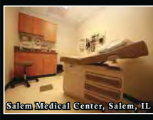
Salem Medical Center, Salem, IL